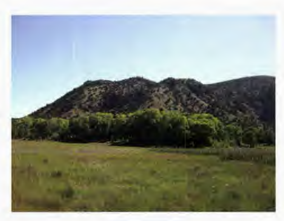
Los Potreros Open Space

The County has recently sought technical advice and assistance from The Trust for Public Land related to ongoing efforts to develop a program to finance land conservation and renew land conservation funding through a potential ballot measure. The scope of work may include feasibility research, evaluation of the feasibility of acquisition, a public opinion survey, recommendations for program design, and assistance with the development of strategies for supporting dedicated, ongoing sources of public funds for conservation. The majority of the services provided by the Trust for Public Land are provided at no cost to the County. These services will augment and assist the County in preparing the Open Space initiatives to be presented to the public for implementing potential financing mechanisms for open space acquisition and maintenance.