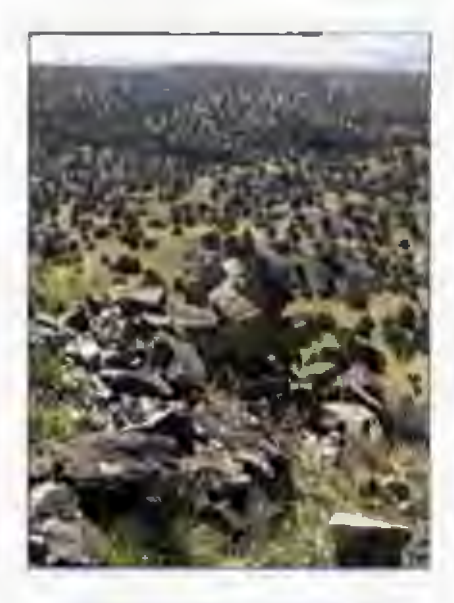
Thornton Ranch Open Space

and geology of the Galisteo Basin. Opening Thornton Ranch will elevate the profile of Santa Fe County for its excellence and progressive approach to managing a resource of national importance within the context of the Galisteo Basin. Developing this project will likely result in an increase in traffic and traffic impacts for County residents along CR 42 and CR55A