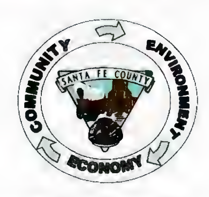
Santa Fe County General Plan