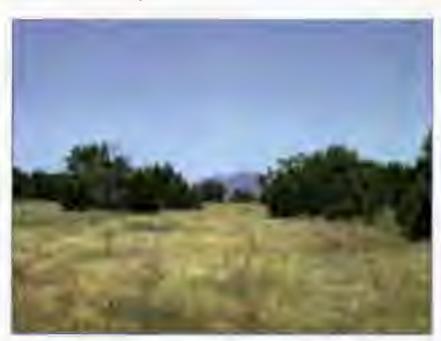
View from Santa Fe Rail Trail

This project involves the development of a Countywide trail plan. It will include acquisition, design and construction of a major trail network in the central portion of the County incorporating the Arroyo Hondo Trail and the New Mexico Central Trail. The trails will provide outdoor recreation facilities and safe alternative transportation routes for non-motorists. An expanded and well maintained trail network will attract tourists who are looking for an outdoor recreation experience. Trails also provide a green alternative to non-motorized transportation. They are an amenity that improves the quality of life in the community. The trails will enhance the reputation of the County as a quality environment to live and work and will help to attract desirable business to the County.